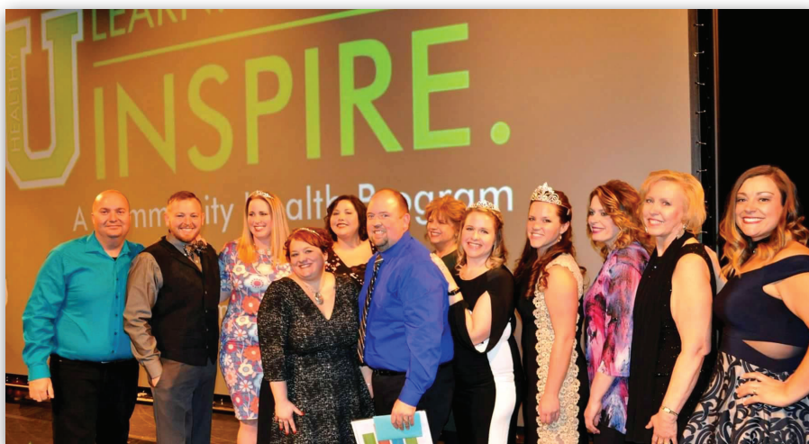
Members of the Healthy U Class of 2017 gather Jan. 4 on the stage at the Heckart Performing Arts Center at Smith-Cotton High School for the Healthy U "Night of Inspiration."