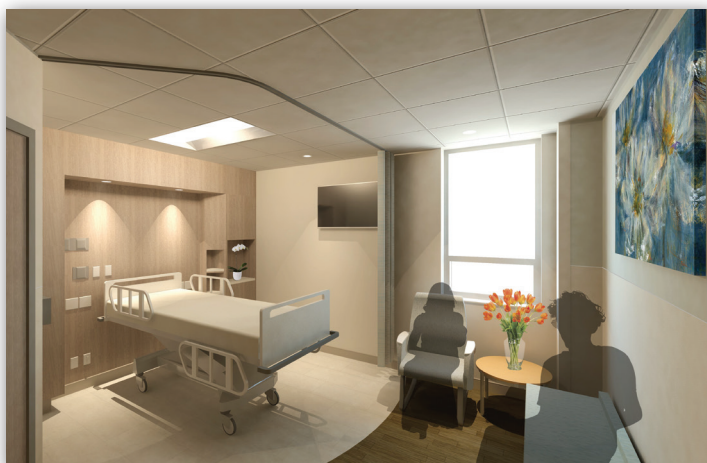
Artist's rendering of the new patient rooms in Women's Health.

Contractors are hard at work on the first phase of construction to transform patient rooms in Women's Health at the hospital. The work will convert nine rooms into six much larger rooms, all with a new look and finishes. Work on this phase is expected to wrap up the first part of June, with additional work planned for the department in future phases of construction.