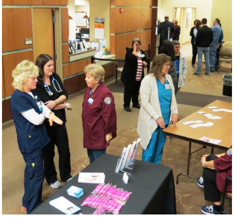
Bothwell Health Center – Truman Lake and Bothwell Peak Sport and Spine held an open house on Thursday, Oct. 25 at the clinic in Warsaw. Visitors were able to meet with clinic staff and learn about the services offered by the clinic.