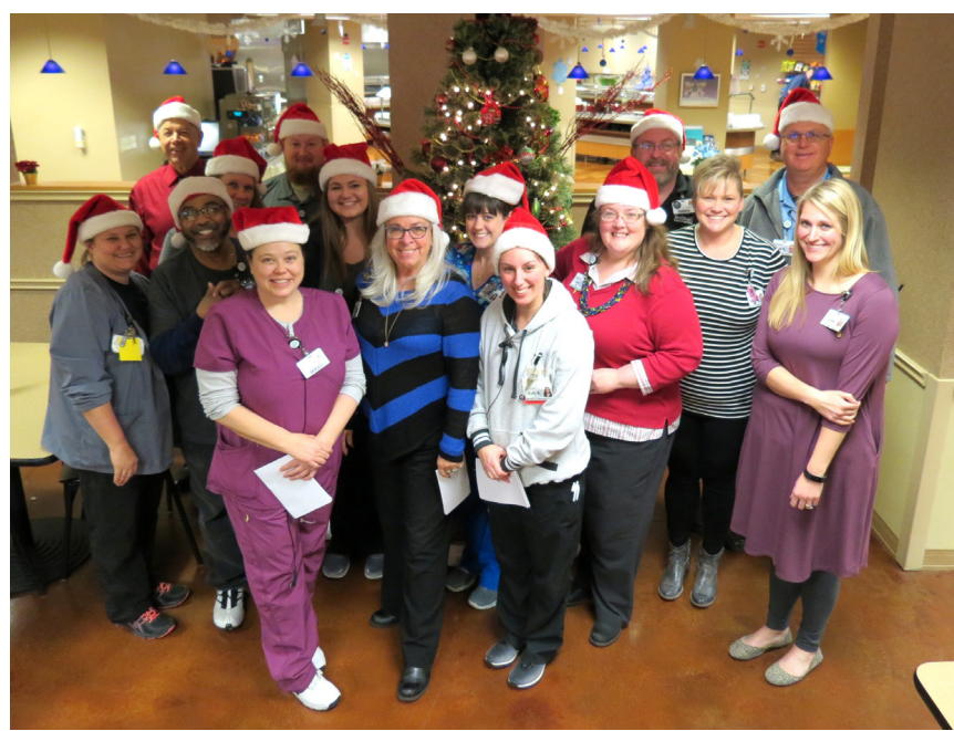
Bothwell carolers gather in the Café on Dec. 20 before making their way throughout the hospital, spreading cheer to patients and employees.

Thank you to all who joined in their year's Christmas celebration at Bothwell!