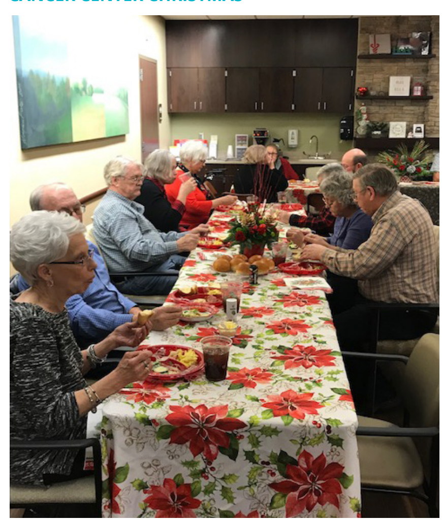
Through a grant the Bothwell Foundation gives each year to the Cancer Center, cancer patients were able to celebrate Christmas with a catered meal, donated gifts and a time of festive fellowship. Cancer center staff organized the party, which some patients said is the only Christmas they get.