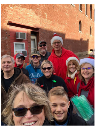
Bothwell employees and family members passed out treats and Bothwell flying discs at Christmas parades in Sedalia (above) and Warsaw (below).