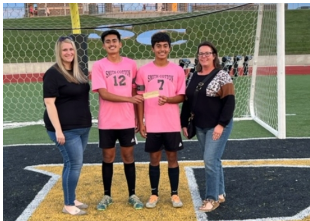
The Smith-Cotton boys soccer team held a 'pink-out' game that raised $1,405 for cancer care.