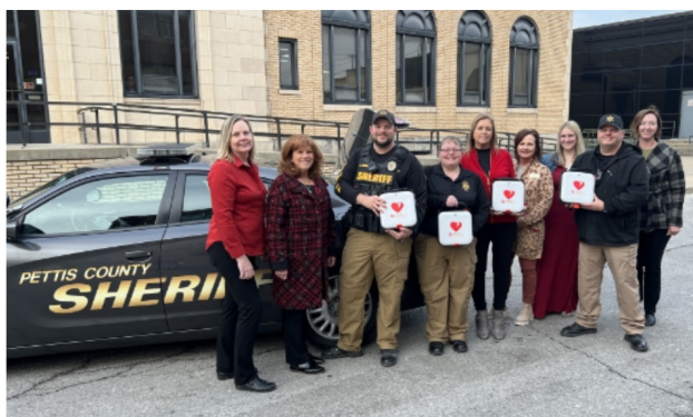
Pettis County Sheriff's Department