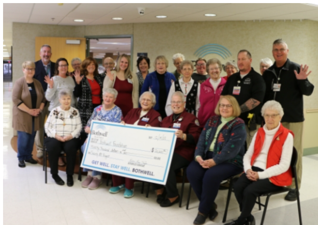
The Bothwell Auxiliary generously donated $20,000 to the K9 Security Project during its holiday tea in December.

We are so fortunate to have individuals and organizations in our community that choose to support the foundation and its projects that ultimately help Bothwell Regional Health Center care for patients. Thank you!