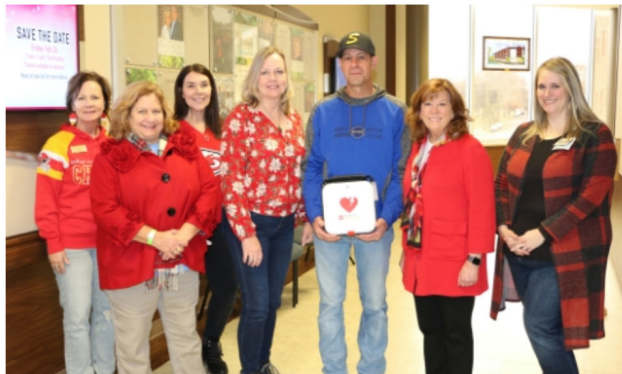
Smithton Sports Complex

The Wear Red for Women committee has been busy over the last few months gifting life-saving AEDS to area venues, businesses and organizations.