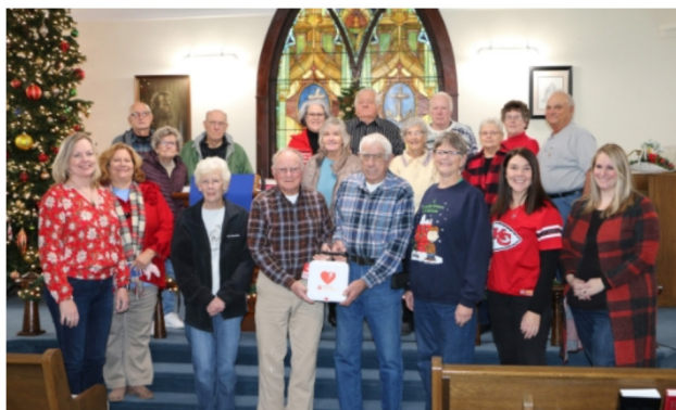
Lake Creek Methodist Church