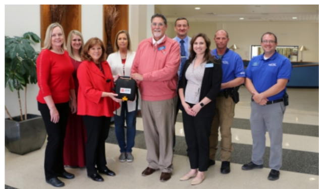
State Fair Community College-Thompson Conference Center