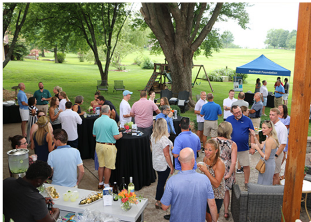
Attendees at the Special Prospects committee's 1930's Social Club August mixer enjoyed socializing and learning about Bothwell Regional Health Center and the Bothwell Foundation's K9 Security Officer project.

"We plan to add committees for Business Relations and Planned Gifts," she said. "With the creation of the new committees, we now have nearly 100 new volunteers supporting the foundation and Bothwell."