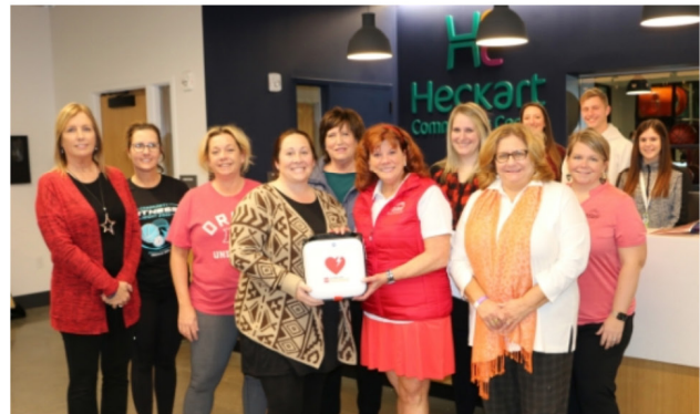
Heckart Community Center