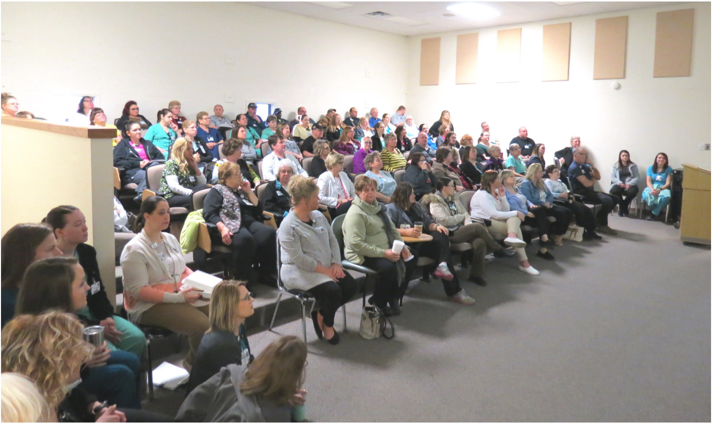
A standing-room-only crowd of employees attended the 2019 Winter Forum March 21 at the Bothwell Education Center Auditorium.