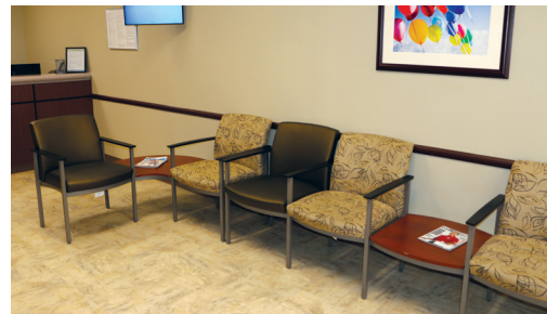
ABOVE: The entrance to the new Bothwell Walk In Clinic at the Healing Arts Center at 3700 W. 10th St. LEFT: The waiting area at the new Walk In Clinic, which opened March 4.