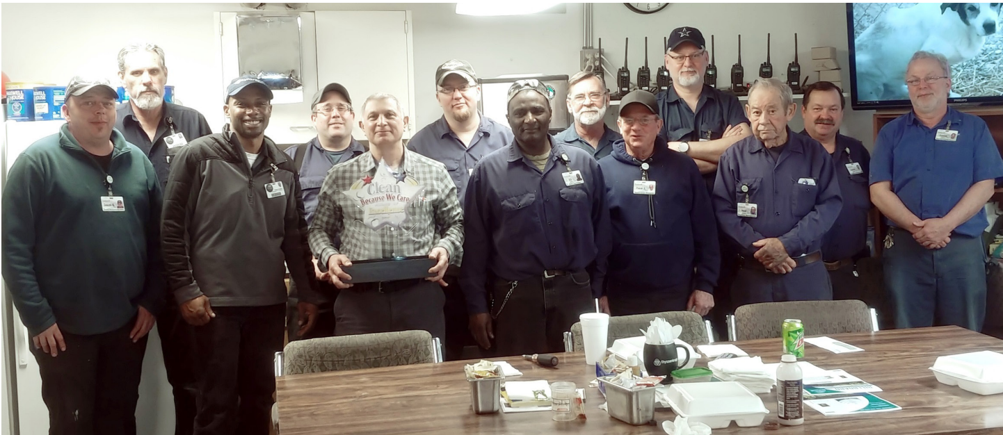
The Sparkle Award last month went to Facilities Management for the great work they did on 3 Southwest and for keeping the hospital parking lots clear and safe for patients and employees during multiple weather events in February and March.