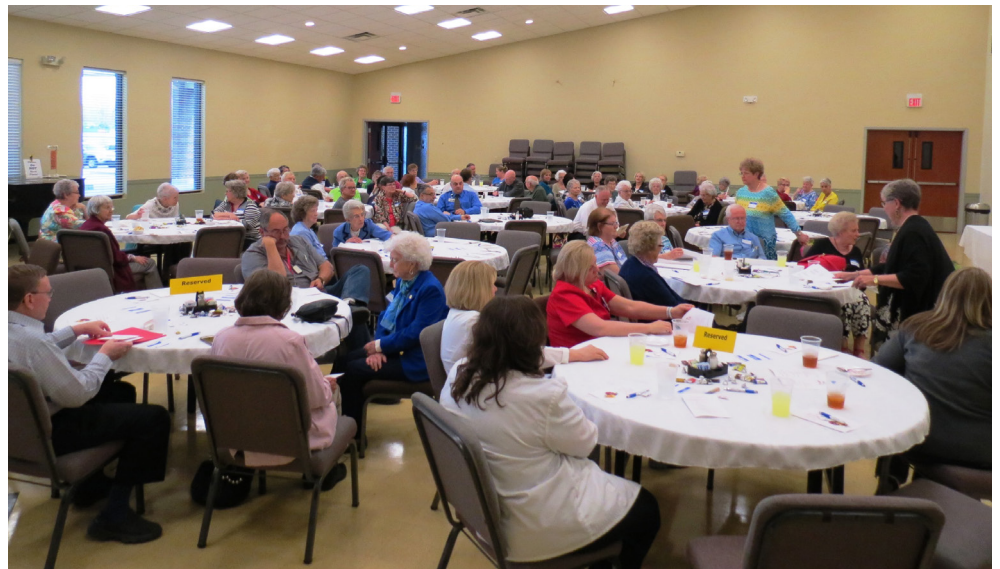
On Thursday, April 25, Bothwell celebrated its Red Cross, Auxiliary and Chaplain Corps volunteers at an appreciation luncheon held at the United Methodist Church's Celebration Center in Sedalia. At right, guests select desserts from the selection set out for meal. Bothwell volunteers were recognized for their hours of service to the hospital. There are about 200 volunteers at Bothwell, and in 2018 they donated almost 24,000 hours of service valued at almost $600,000.