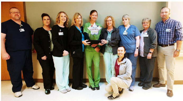
The Sparkle Award this month went to the Radiology Department for excellent hand hygiene.