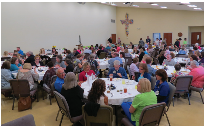
Bothwell employees celebrating milestone years of service were treated to a luncheon May 15 at the First United Methodist Church Celebration Center to recognize their service to the hospital.