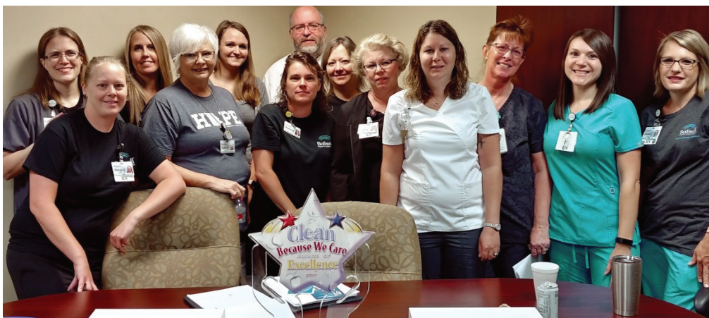
The Sparkle Award went to the Cancer Center for excellent hand hygiene and for their patient safety awareness, contacting Infection Control when needed for circumstances that could put patients at risk for infections.